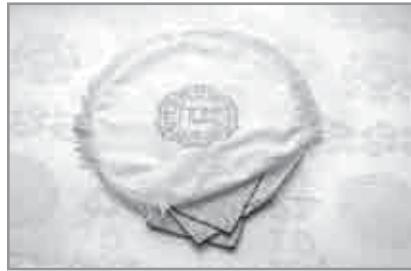
Matzah Tash (Bread Bag)

Matzah Tash – This is the matzah bag, also referred to by many Jewish people as the Echad , meaning “unity.” It contains three compartments with one slice of unleavened bread (matzah) in each compartment. The second compartment contains the Afikomen.